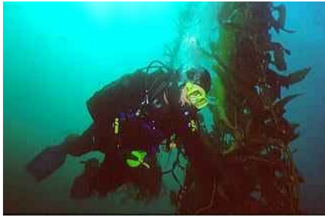
Point Loma, San Diego