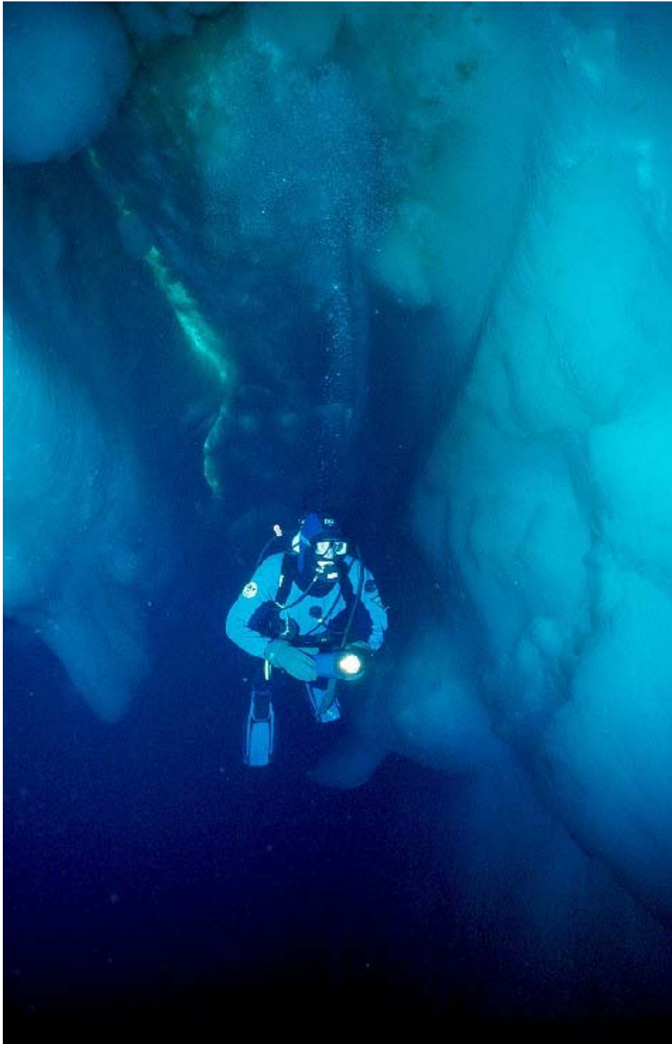
Grounded Iceberg near Cape Barne, Ross Island, Antarctica