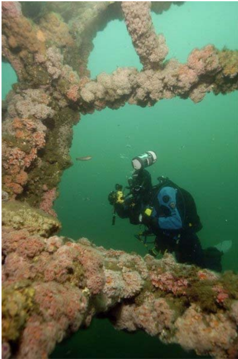
NOSC Tower, San Diego