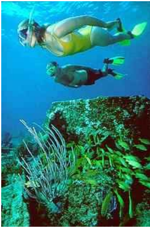
Sugar Wreck, Bahamas