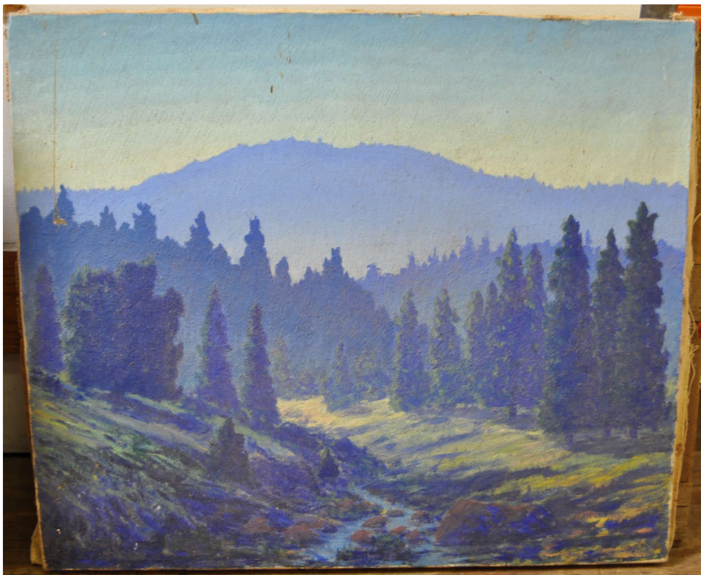
No. 22. Name: Price: Little stream in center -- bank at left -- slope of trees at right -- grassy ridge -- with trees backed by blue ridge against blue sky. 20 x 26.