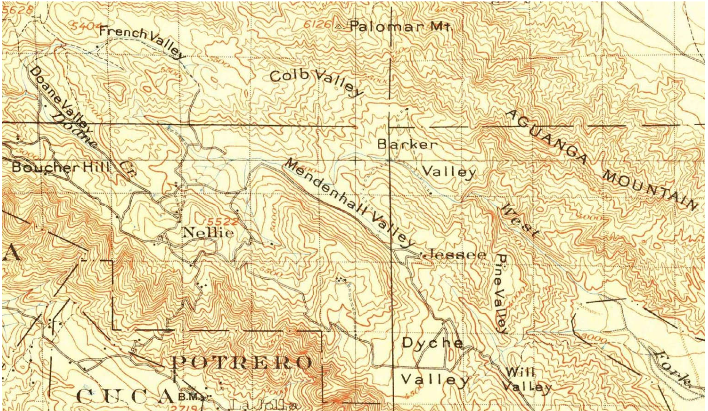
Barker Valley on the 1903 U.S.G.S. Ramona map

Information and photograph sources in this biography are cited except for ancestry.com, familysearch.org, and findagrave.com; therefore, an uncited fact or photograph came from those sources.