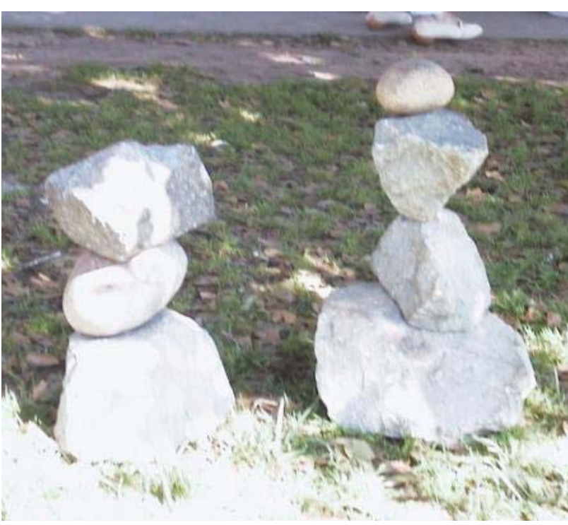
Concentrate Did it