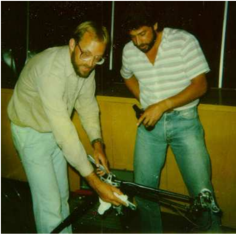
During B.I.K.E. Clinic, the B.I.K.E. Technical Consultant does quality control check on "B.B.B" (B.I.K.E. Bottom Bracket) while the B.I.K.E. Technical Assistant looks on. [6/1/84]